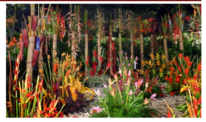
Heliconia display at the Medellín Flower Festival.

of Bali and Java, on the other side of the world, in the middle of the Pacific Ocean, home of the next HSI Conference XVIII 2014.