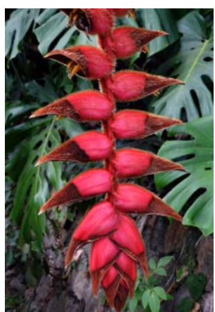
A red form of H. regalis.

next year's Meet the Experts Conference. The huge mariposarium was full of colorful butterflies and the food catering, with local Colombian dishes, was mouth watering. Later on, the next day, we took a seven and a half hour drive to Medellín through mountainous curves. When we ar-