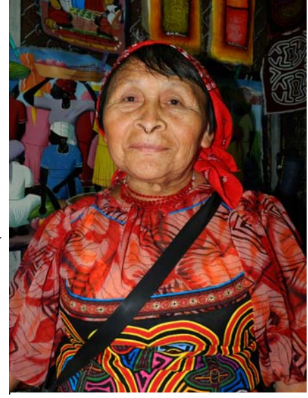
Indigenous Kuna woman of Panama.