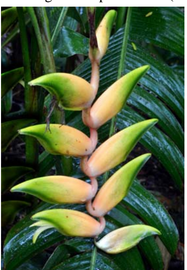
An unusual form of Heliconia rostrata.

decade passionate effort, spearheaded by dynamic Alvaro Calonje Daly. The private grounds are impeccably kept and the collection, consisting of over 2,200 plants, is simply amazing! The vegetarian lunch was out of this world. On our way, to and from, Armenia, we saw endless sugar cane plantations (in