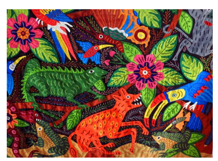
A beautiful traditional Panamanian mola.

Soon, we realized that after having been travelling together for two weeks, the HSI delegation had to return to their respective countries. On August the 7th, the dream was over. We promised to see each other again, in two years time, in Southeast Asia's far away islands