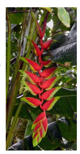
Heliconia rostrata x standleyi hybrid?

smile. Without them, our experience would not have been as memorable. Overall, on this action packed eco-tourism trip, we saw 36 "new" varieties of heliconias (which we had not seen in person, only in books) and were able to collect seeds from the majority of them, to be grown in our precious HSPR Conservation Centers.