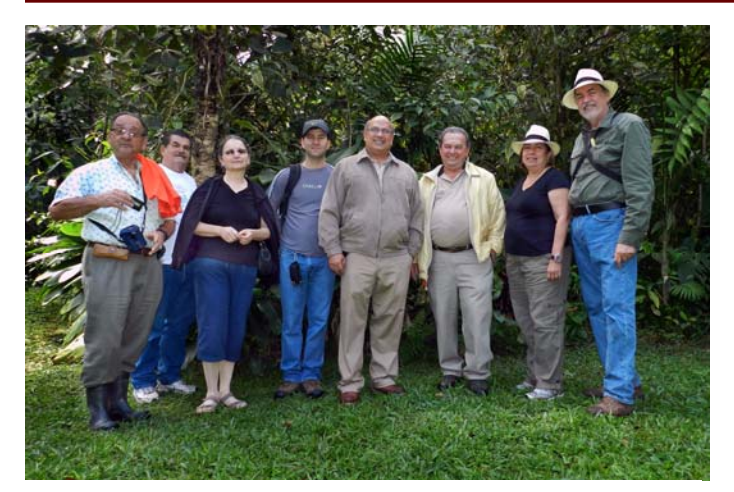
The Puerto Rican delegation at the post-tour of the Heliconia Society International Conference.

The following morning we toured the grounds, but were unimpressed by the lack of heliconias. Costa Rica is known as one of the main breeding grounds for heliconias in Central America. After lunch, we headed back for the border, on our way to Volcán, on preparation for the next day's flight from David to Panamá City. From the capital, we travelled in two buses to El Valle de Antón, to participate in the HSI XVII Conference.