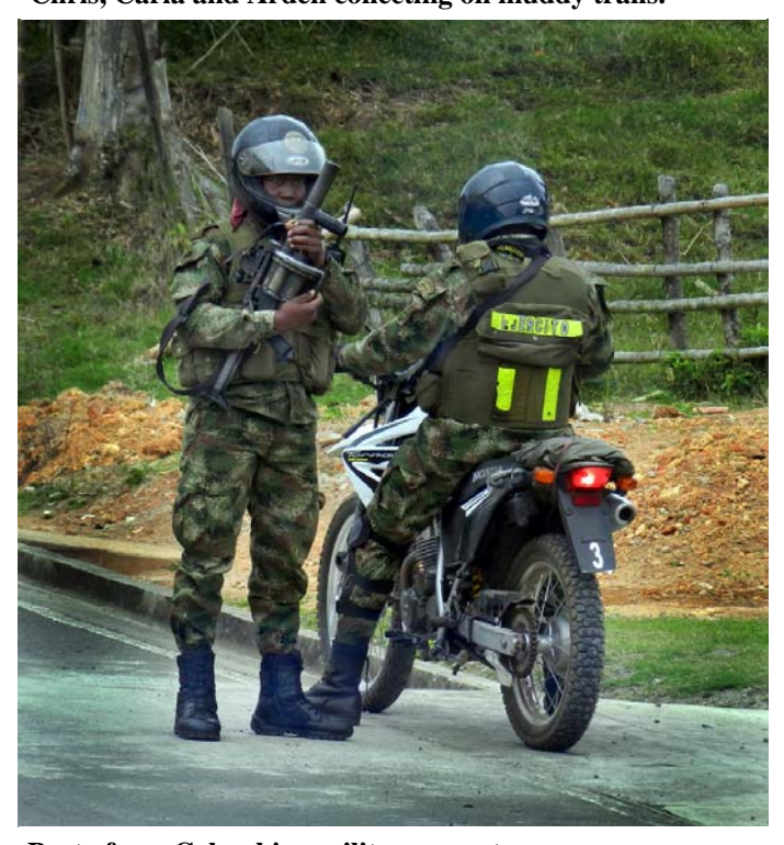
Part of our Colombian military escort.