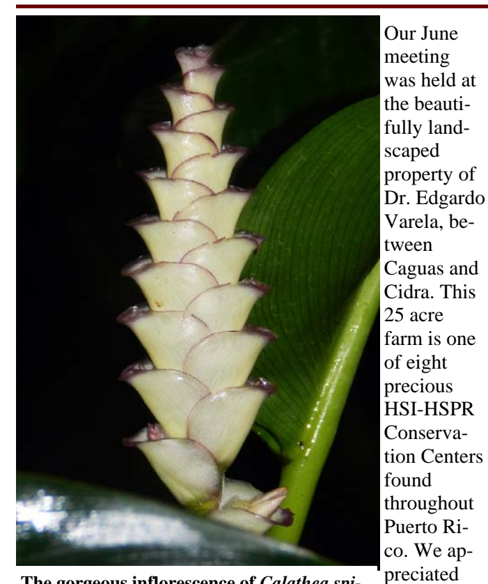
The gorgeous inflorescence of Calathea spiralis.